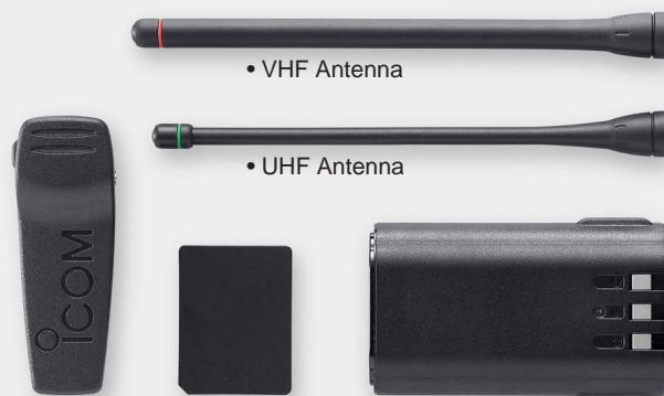
• Belt clip, MB-94 • Unit cover • Battery pack, BP-231